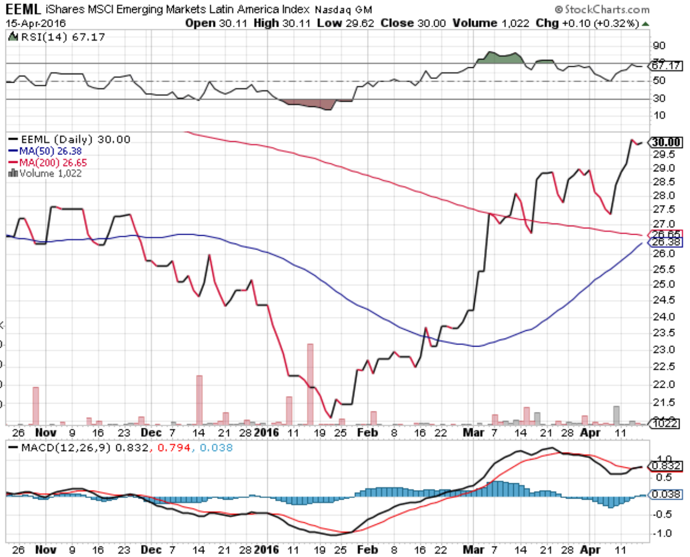
Equities - EMERGING MKTS