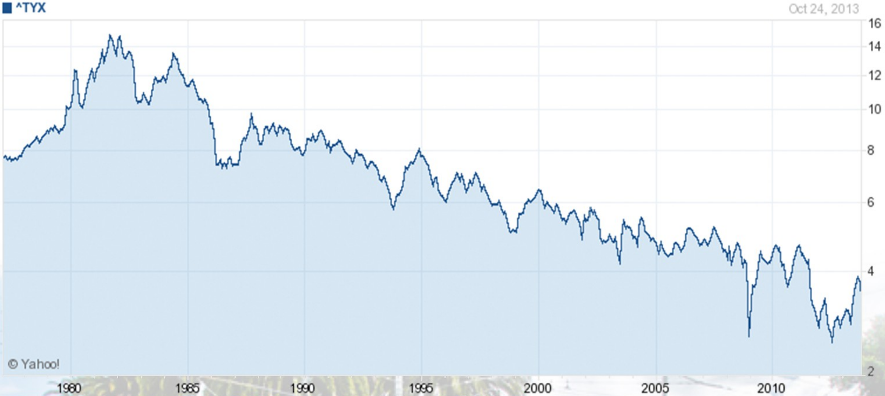
Treasury Yield 30 Years