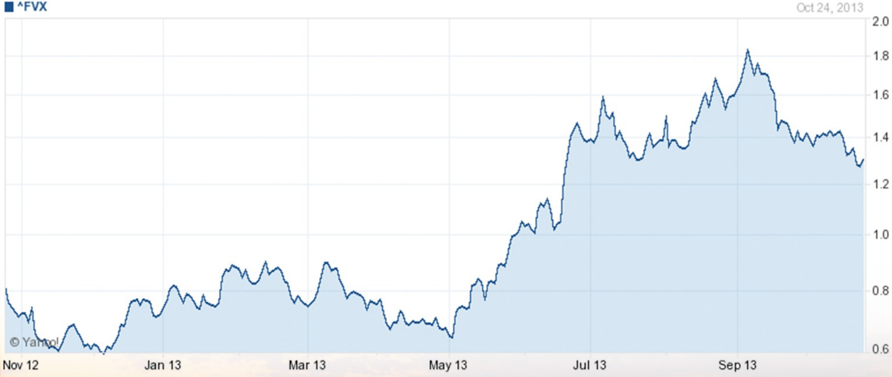
Treasury Yield 5 Years